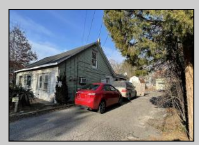
731 White Horse Galloway Township, NJ 08205