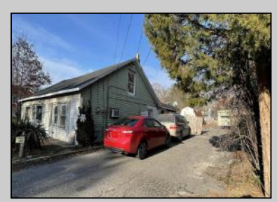
731 White Horse Galloway Township, NJ 08205