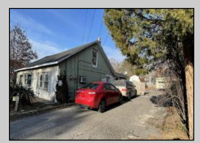
731 White Horse Galloway Township, NJ 08205