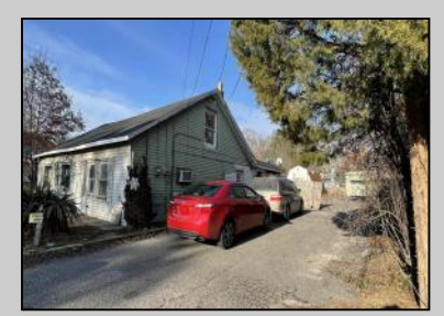
731 White Horse Galloway Township, NJ 08205