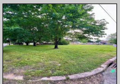
00 Central Galloway Township, NJ 08215