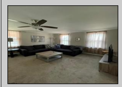
2334 Route 50 Woodbine Borough, NJ 08270