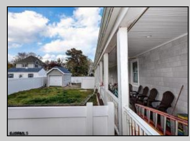
123 Cedar Ave Somers Point, NJ 08244