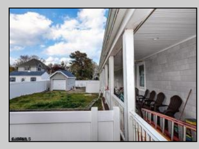
123 Cedar Ave Somers Point, NJ 08244