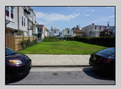
19-21 Texas Atlantic City, NJ 08401