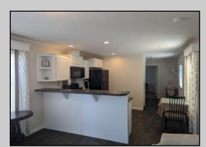
430 Route Us 9 S Marmora, NJ 08223