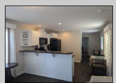
430 Route Us 9 S Marmora, NJ 08223