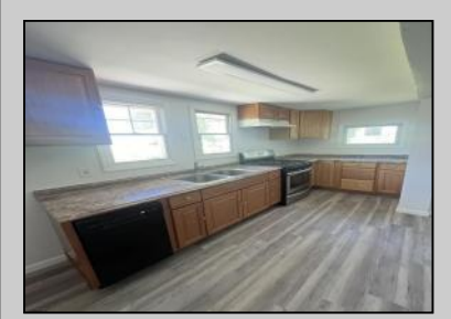
789 Seventh Vineland, NJ 08360