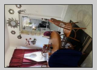
17 Sovereign Atlantic City, NJ 08401