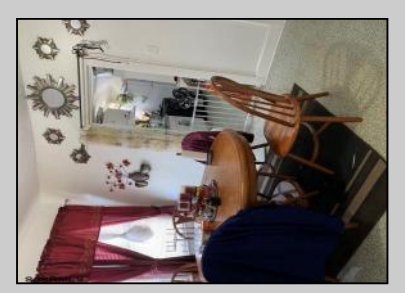
17 Sovereign Atlantic City, NJ 08401