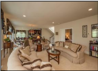
286 Riverside Port Republic, NJ 08241