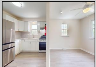
406 Larchmont Pleasantville, NJ 08203