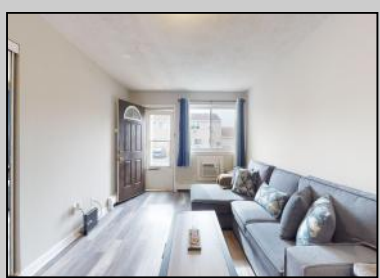
4901 Harbor Beach Brigantine, NJ 08203