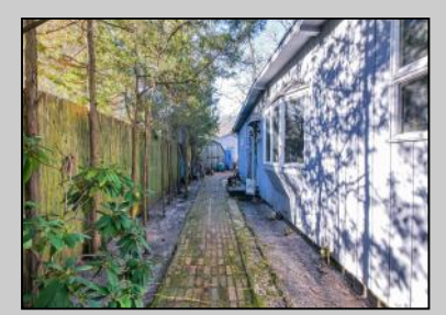
1211 Riverside Mays Landing, NJ 08330