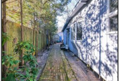
1211 Riverside Mays Landing, NJ 08330