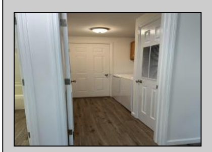
177 Turnberry Mays Landing, NJ 08330