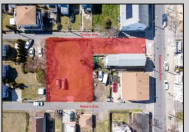
414 Hobart Atlantic City, NJ 08401