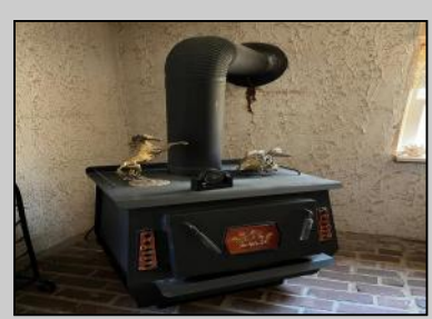
450 Weymouth Rd Buena Vista Township, NJ 08310