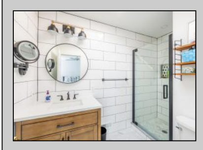
133 Wesley Ave Ocean City, NJ 08226