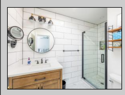
133 Wesley Ave Ocean City, NJ 08226