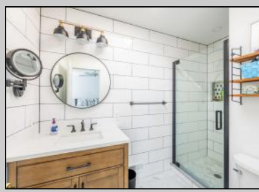
133 Wesley Ave Ocean City, NJ 08226