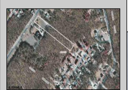
765 Route 54 Williamstown, NJ 08094