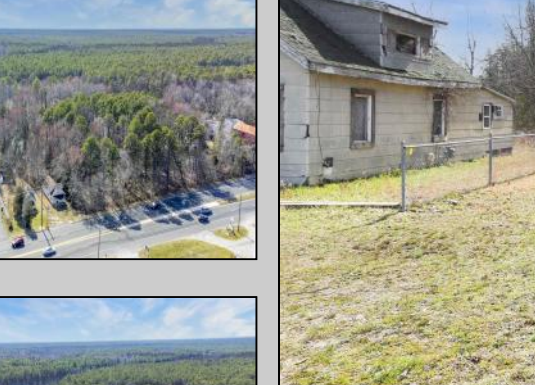
5837 White Horse Pike Egg Harbor City, NJ 08215