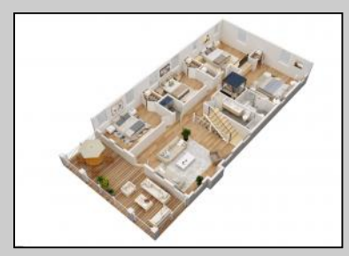
307 Battersea Ocean City, NJ 08226