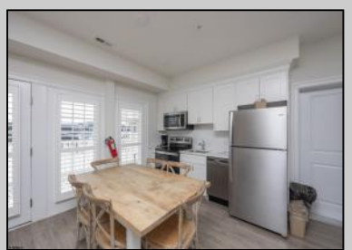
719 10th Ocean City, NJ 08226