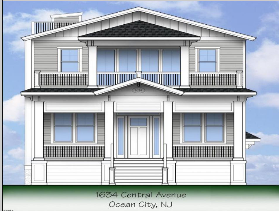
1634 Central Avenue Ocean City, NJ