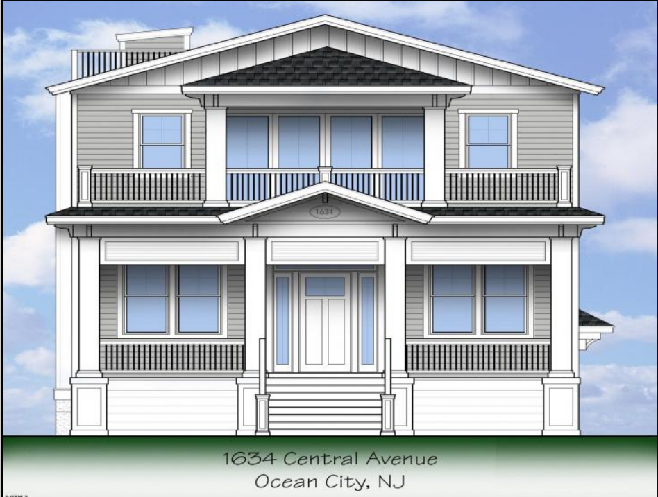
1634 Central Avenue Ocean City, NJ