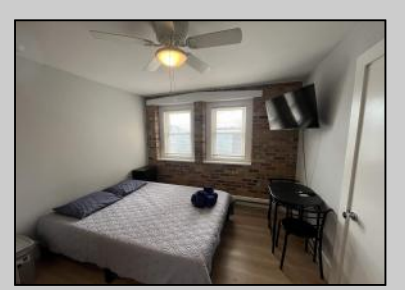
807 8th Ocean City, NJ 08226