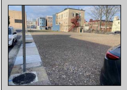
1509 Belfield Atlantic City, NJ 08401