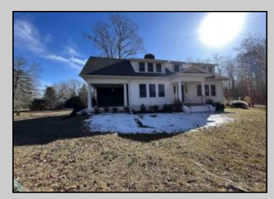
715 Elwood Hammonton, NJ 08037