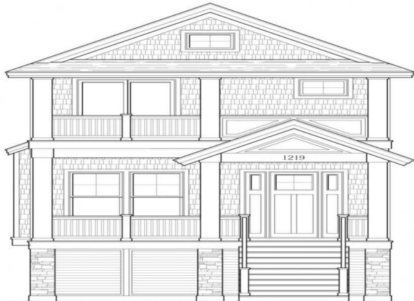
HAVEN AVENUE ELEVATION