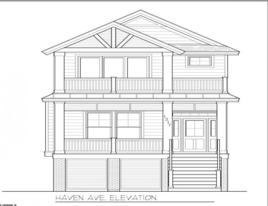
HAVEN AVE. ELEVATION