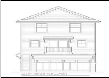
ALLEY REAR ELEVATION