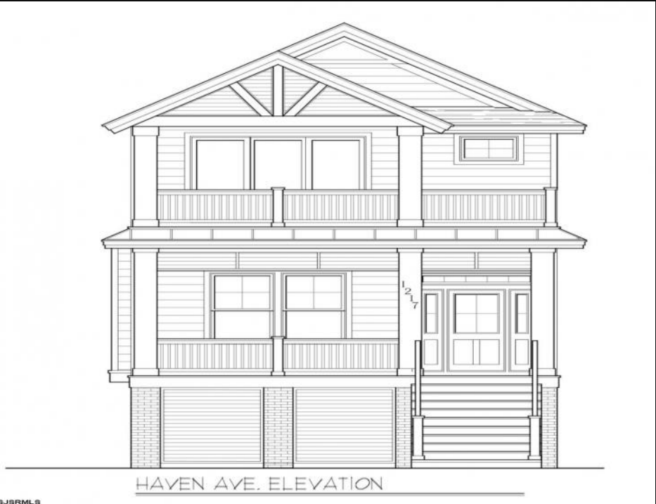
HAVEN AVE. ELEVATION