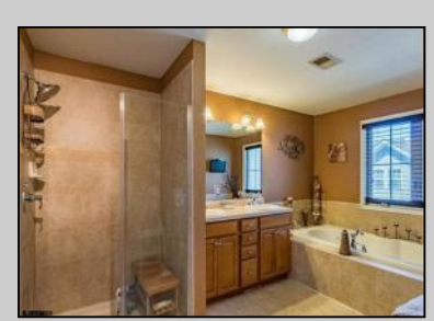
101 DUNLIN LANE Egg Harbor Township, NJ 08234