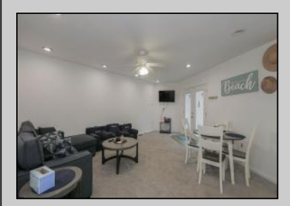
3210 Atlantic Brigantine Blvd Brigantine, NJ 08203