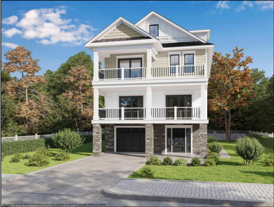
Rendering is for illustrative purposes only and is subject to change without notice.