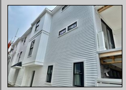
637 Ocean Ocean City, NJ 08226