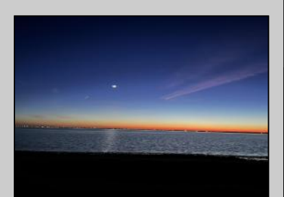
214 Oxford West Atlantic City, NJ 08232