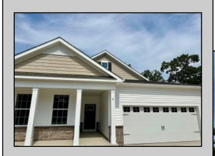
2 Hawks Ridge Dennis Township, NJ 08210