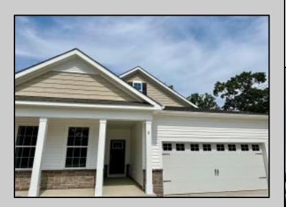
2 Hawks Ridge Dennis Township, NJ 08210