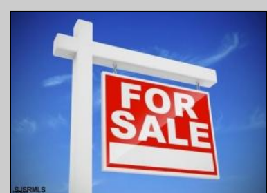
6508 Black Horse Egg Harbor Township, NJ 08234