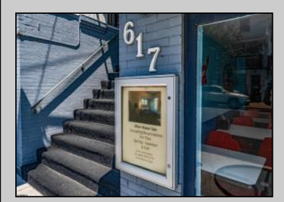
617 8th St Ocean City, NJ 08226