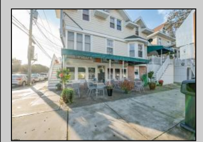
601 Ocean Ocean City, NJ 08226