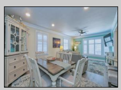
301 40th St S Brigantine, NJ 08203