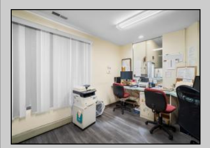
258 New Rd Pleasantville, NJ 08232